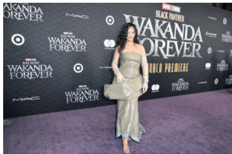
Rihanna arrives at the world premiere of "Black Panther: Wakanda Forever" on Wednesday, Oct. 26, 2022, at the Dolby Theatre in Los Angeles.

The "Savage X Fenty Show Vol. 4" will be available to stream Wednesday on Amazon Prime Video. □